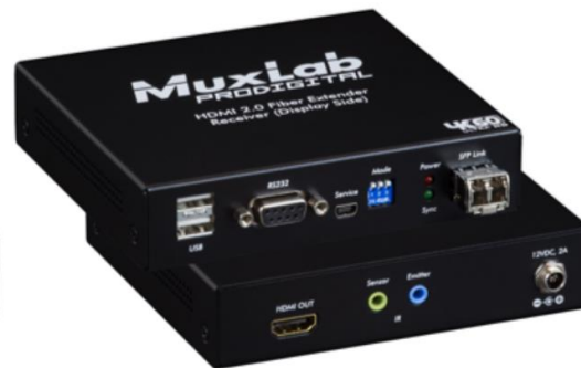
Receiver (Display Side)