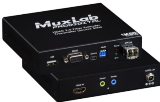
Transmitter (Source Side)