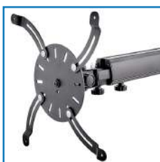
4 mounting holes