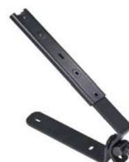
EU-00555 Adjustable black wall mount for CLA 85 / 88 / 168