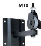
EU-01480 Adjustable wall mounting - Wall plate: W105 x H120 mm - Length: 170 mm - Max Load: 10 Kg / Wht: 0.8 Kg - Rotation: 0 - 360° / Tilt: 0 - 90°