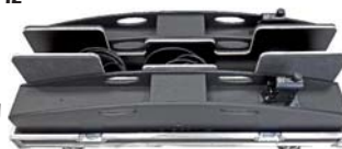
FC-2CLA810 (29 Kg)

FC-2CLA810 (optional) Flight-case for x2 CLA810 +2 tubes