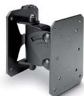
HO-RI-SR20(B/W) Black or white fixing ball for CLA-810