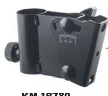
KM-19780 KIT: Black tilt adapter + Black adaptation plate