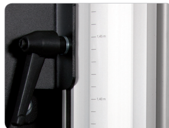
Flat panel position ruler