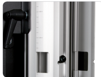
Easy cable access