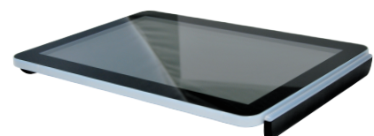
Unlit LED Panel shown

The Adapt-IQV 10.1" is designed with high-quality ABS case with modern zero-bezel design, thus greatly improving scratch resistance.