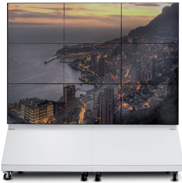
FSW-3x3 basic model