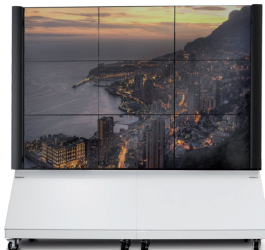
FSW-3x3 with optional 2 vertical passive soundbars