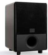
Active subwoofer LSS-80SW