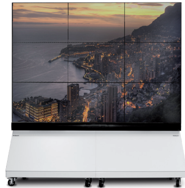
FSW-3x3 with optional 1 horizontal passive soundbar