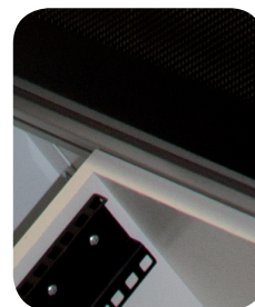
Detail Decor panel and 6HE 19" furniture