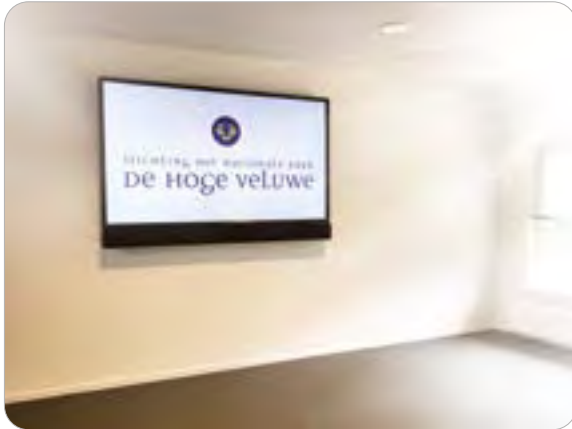
Wall mounted soundbar with 84" screen